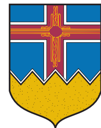
Diocesan Coat of Arms